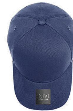
INIVI Revolutionary 5-panel