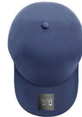
INIVI Revolutionary one-panel